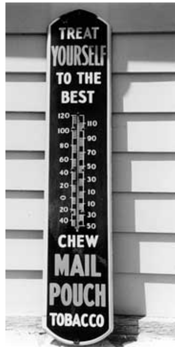
Figure 5: The Mail Pouch alcohol thermometer that Robert Johns used to make his temperature measurements. The thermometer housing measures 99 by 20 cm (39 by 8 in).

And then I would keep track of the clouds in my journal. It is a little hazy in Indiana, so I used these filtered glasses (lenses), something cheap I could buy at the drug store, to try to get a better view of the clouds. I didn't really know too much about what was going on, but I could recognize the changes in the clouds as the storms would approach. The project was to last 3 or 4 weeks, but mine just kept on going. I kept these weather records up to the time I went away to college [See Fig. 6].