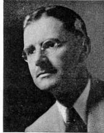
Figure 7: A picture of George Stewart, author of Storm , with an excerpt from the article by Henry Canby in Book-of-the-Month Club (Canby 1941).

Storm is unique in that it does this in highly dramatic fiction, with the reader as an Olympian watching countless scattered little human beings involved and unified in this vast sweep of the elements. The book deals, like a novel, with stories of human life, yet it is based on new scientific knowledge, and the storm is its hero or rather, its heroine.