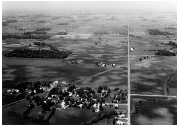
Figure 2: Aerial view of Terhune, IN, looking west. Monon Railroad (Indianapolis to Chicago Line) cuts across the section roads (ca. 1970). The grain elevator can be seen beyond the railroad tracks.